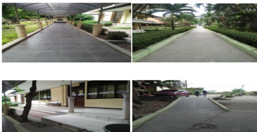
Figure 2. Campus Environment of the Faculty of Education, Universitas Negeri Surabaya

The audio programme for the road route guidance is equipped with clues or signs that can be used as a benchmark for visually impaired students during mobility, such as a sign or clue contained in the campus environment for mobility in the department of Special Education, Faculty of Education staff office, faculty's library as well as tangible stairs, the edge of the park and the road surface. Figure 2 shows an illustration of the sign or clue contained within the campus in the Faculty of Education, Universitas Negeri Surabaya.