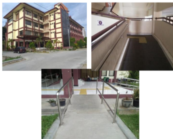
Figure 3. Visual impairment accessibility area in special education department building

Based on the five stages used in the development research procedure, the results of the prototype product model show the social mobility orientation and communication based on android applications in understanding the concept of campus environment for visually impaired students (Figure 3).